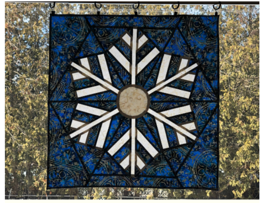
EPIDA DESIGNS Winter Window Hanging