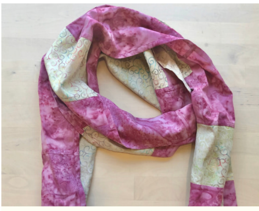
EPIDA STUDIO Elegance Scarf Pattern