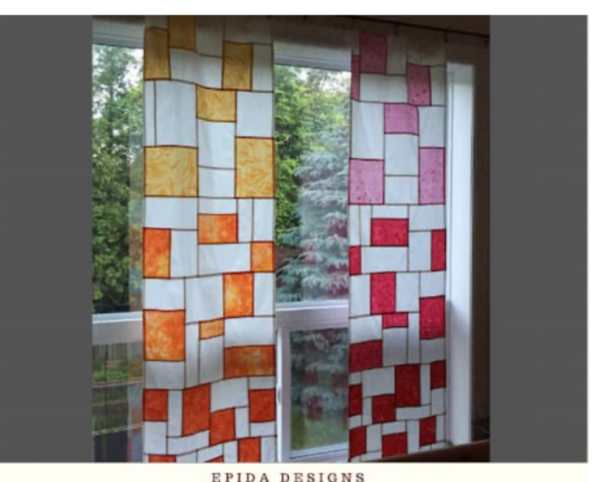
Gradient Panels Pojagi Window Hanging