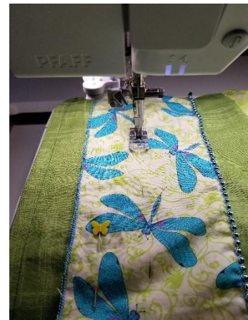
Top of fabric tube with ruffle

Sew along the marked stitch line, which creates a 6-inch-wide tube that will cover the foam wreath